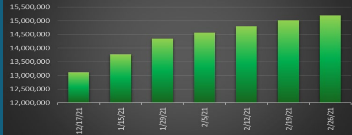
Aging Matters Meals Distributed