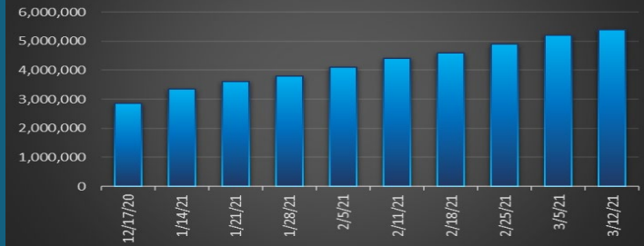
Second Harvest Food Bank Meals Distributed